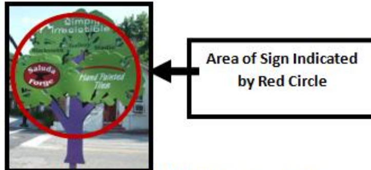
Example Illustrating Measurement of the Area of an Irregularly Shaped Sign

SIGN COPY. Any graphic design, letter, numeral, symbol, figure, device or other media used separately or in combination that is intended to advertise, identify or notify, including the panel or background on which such media is placed.